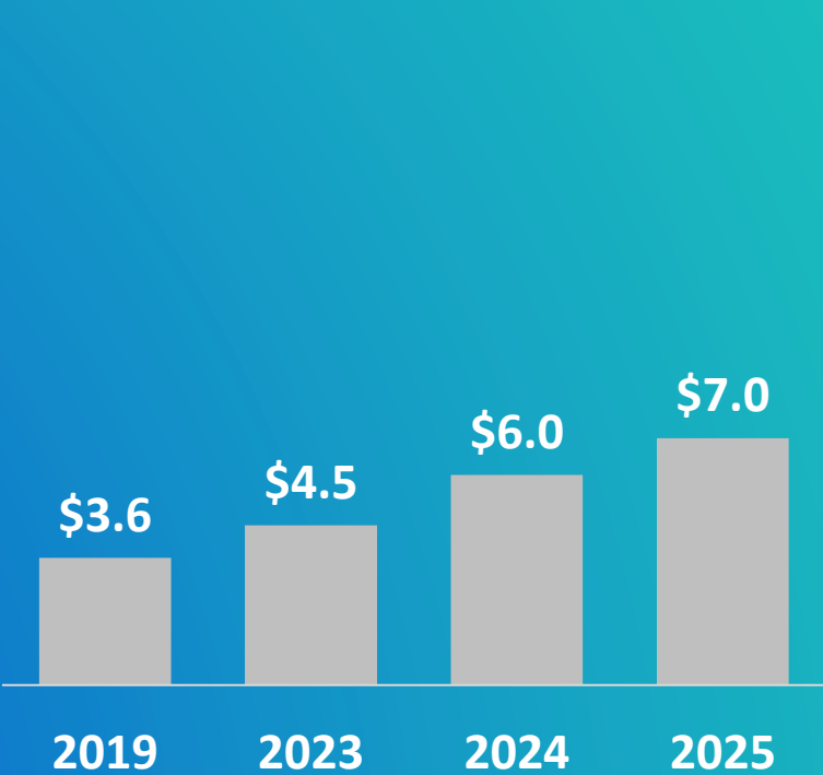
Adj. EBITDA (Billions)